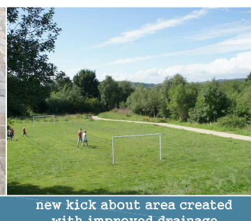
new kick about area created with improved drainage