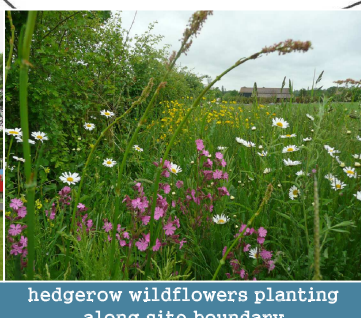
hedgerow wildflowers planting along site boundary