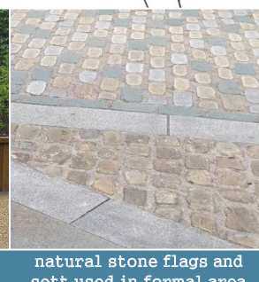
natural stone flags and sett used in formal area