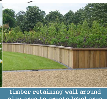
timber retaining wall around play area to create level area