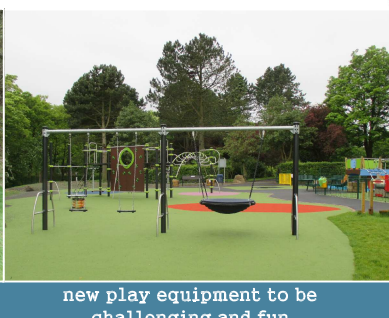
new play equipment to be challenging and fun