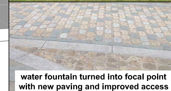
water fountain turned into focal point with new paving and improved access