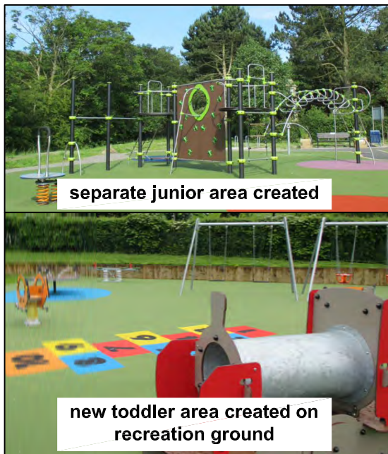
separate junior area created