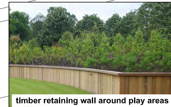
timber retaining wall around play areas