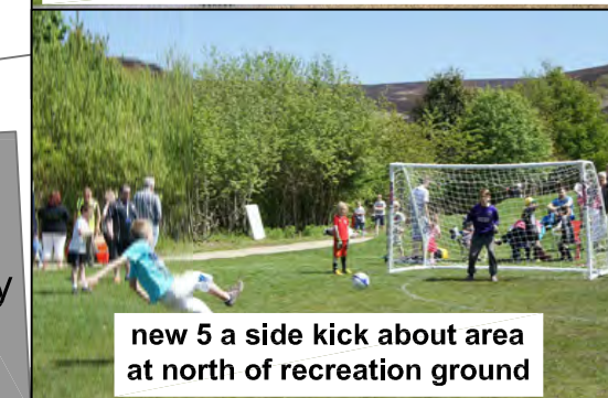
new 5 a side kick about area at north of recreation ground