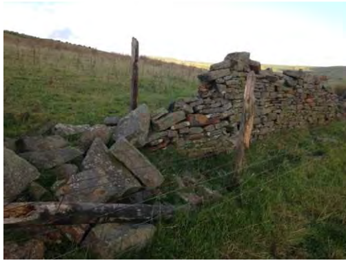
Wall at FP 41 Peers Clough 2016