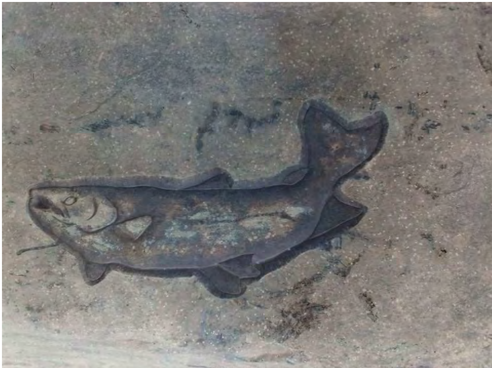
SALMON CARVING ON RECLAIMED STONE