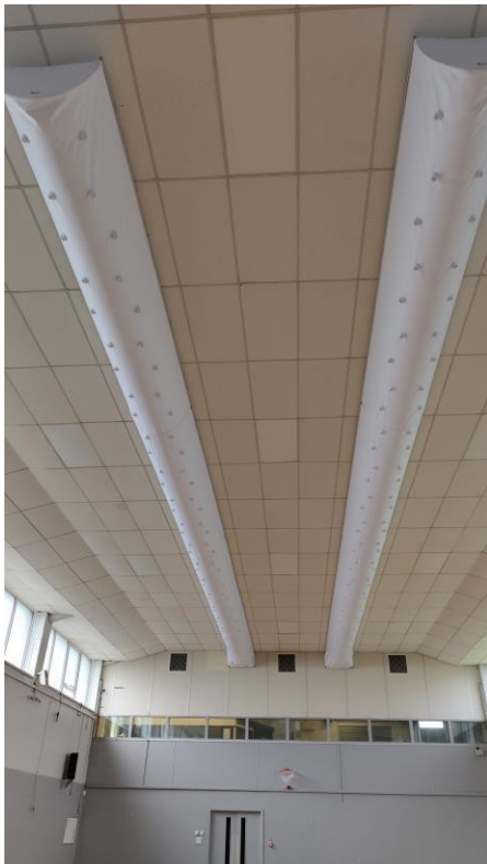
Heating and Ventilation Improvements, Mellor Village Hall