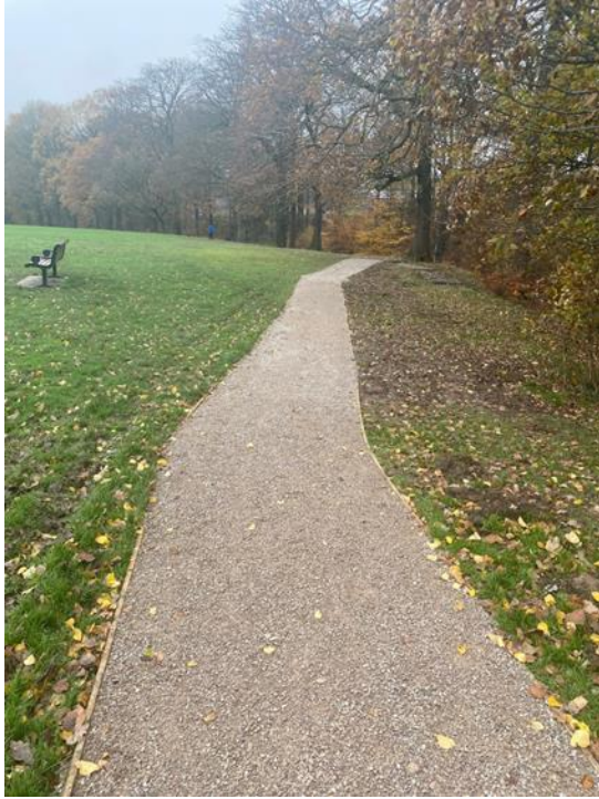
All Access Path, Astley Park Trail, Chorley