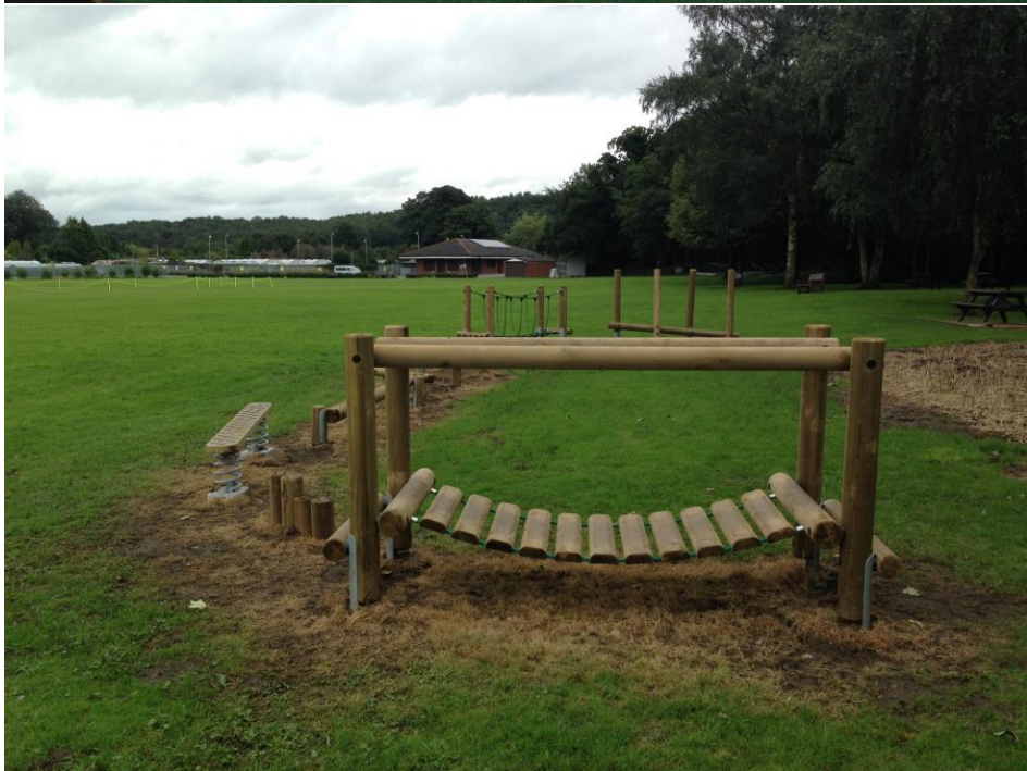
Playground, Adventure Trail and Woodland Walk, Walton-Le- Dale