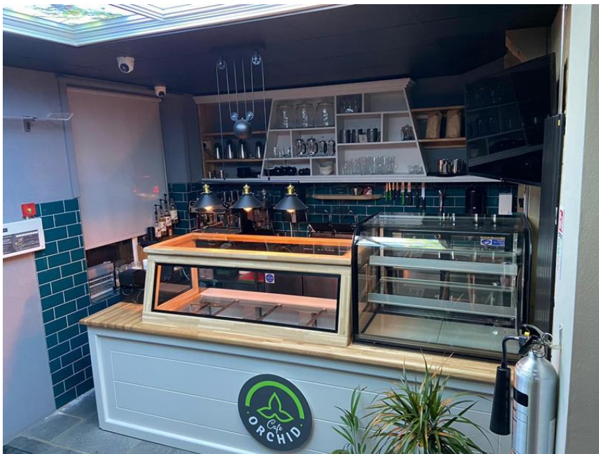
Community Café Brierfield